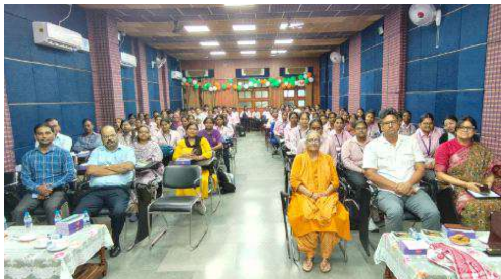
Figure 9: Faculty and Students Present During the Event