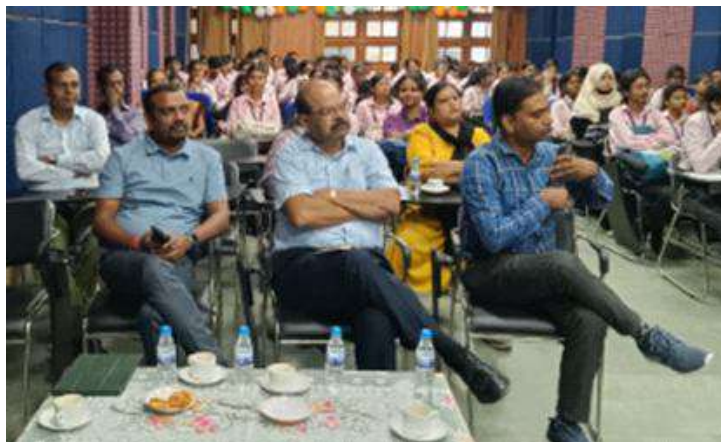
Figure 6: Faculty Present